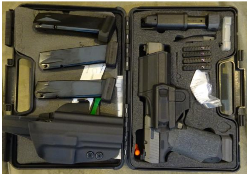
Canik TP9fsx, 9mm